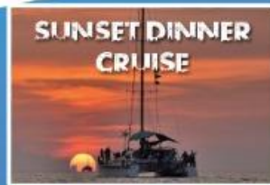
SUNSET DINNER CRUISE